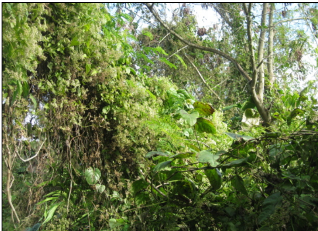
Fig 7. Abandoned nursery infested with Mikania micrantha . (Photography credit: Andrew Derksen, FDACS-DPI-CAPS).