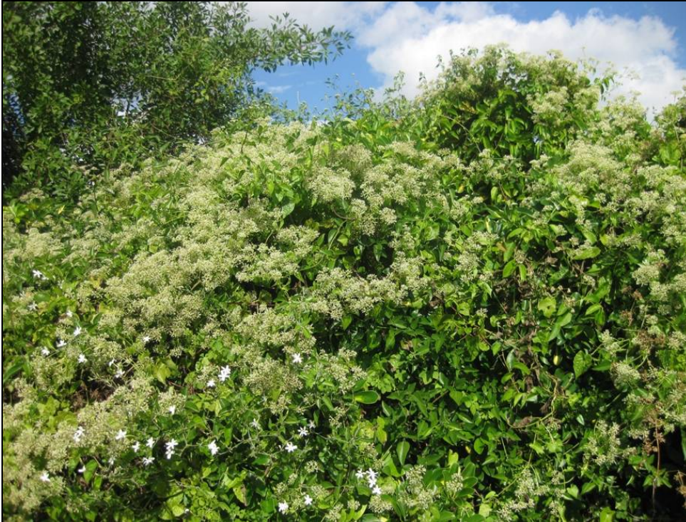
Fig.1. A population of Mikania micrantha found in the Redlands agricultural production area, Homestead, Miami-Dade Co. (Photography credit: Andrew Derksen, FDACS-DPI-CAPS).