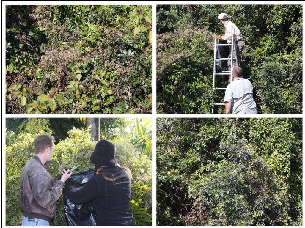
Fig. 6. Survey and eradication team removing Mikania micrantha in the field in Miami-Dade Co.