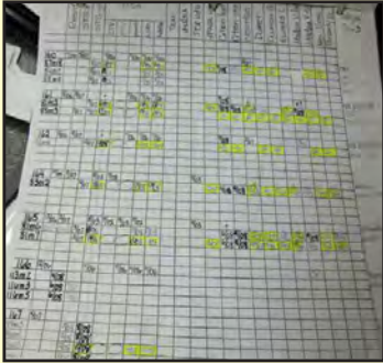
Record-keeping on paper.

CGIP is processing a total of 73 citrus selections: 22 "imports" and 51 Florida-grown.