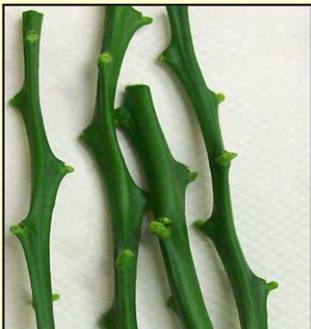
Citrus budsticks for heat-treating and sprouting to produce the shoots and meristems necessary for STG.