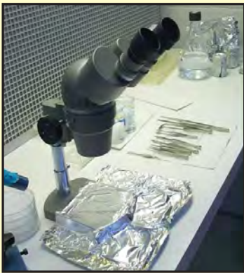
The old microscope, CGIP.

Accurate record-keeping and documentation are important aspects of tracking new citrus introductions and their progress. In order to better organize our expanding program, data-management professionals are developing computer database applications to streamline record-keeping, and allow for easier and quicker data entry, access and retrieval.