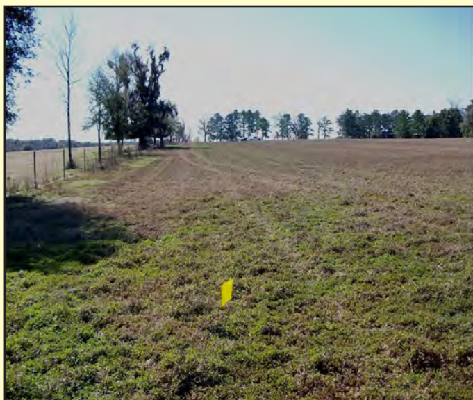
Alachua, February 2009.

A yellow-flag marks the corner of a 5-acre site provided by UF for construction of the Citrus Repository at Boston Farm.