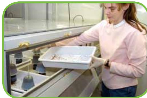
DPI Biological scientist prepares RIFA attack boxes

An innovative rearing operation was established at the facility that promoted high parasitization rates. In the first year, 450,000 phorid flies were produced. Now over two million flies and three species are produced each year in the Gainesville facility. In addition to supplying flies for field release in Florida, the rearing facility supplies flies for field release and research to other states under the cooperative program.