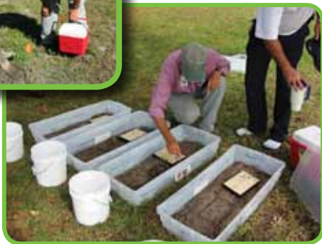
Phorid fly release team members dig shovels full of RIFA from their mounds and place them in plastic boxes where the phorid flies are released over them for a period of time to allow parasitization to occur