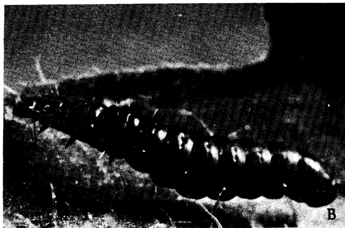
FIG. 1. KEIFERIA LYCOPERSICELLA , THE TOMATO PINWORM: (x 17) A. ADULT; B. LARVA ON TOMATO LEAF.